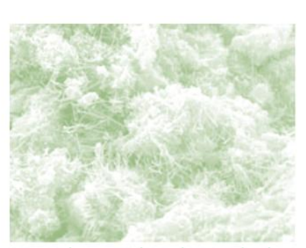
Void completely sealed