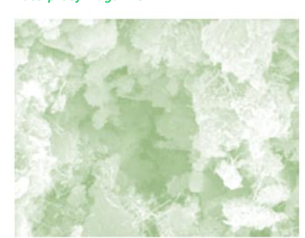
Void clearly visible

Photos shot through an electronic microscope, demonstrate how crystalline waterproofing can physically block the moisture coming through the pores and hairline cracks in concrete. Waterproof Magazine.